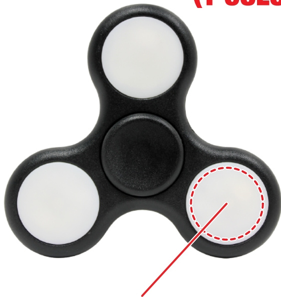
3/4" Diameter Pad Print