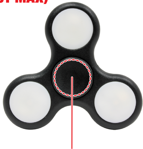
3/4" Diameter Pad Print