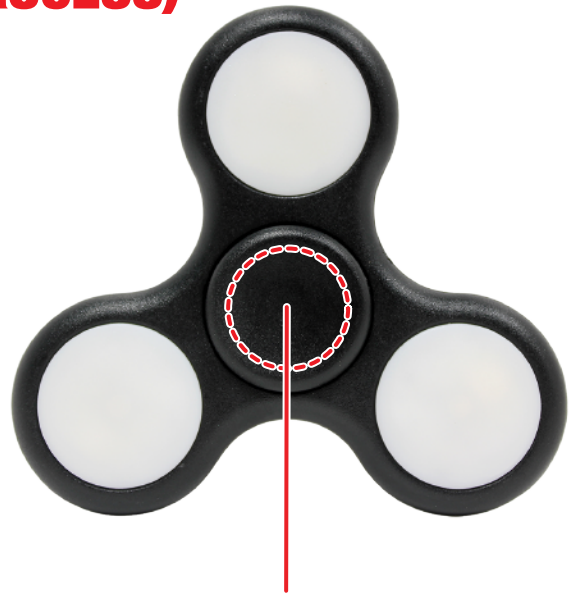
5/8" Diameter Digi-Print